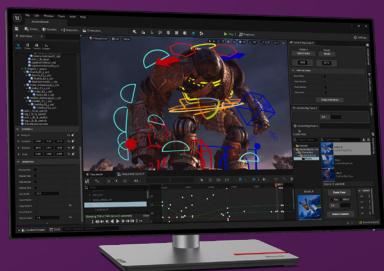
ThinkVision P27h-30 Display