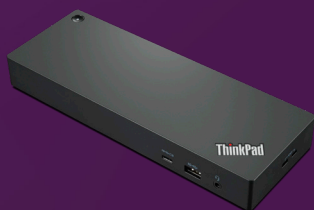
ThinkPad Workstation Thunderbolt™ 4 Dock PN: 40B00300xx